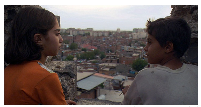
Gülistan (Şenay Orak) and Fırat (Muhammed Al) are forced to live on the streets of Diyarbakır after their parents are killed.

Deleuze defines the intervention in the imagination of a seamless national consciousness as another aspect of modern cinema. Drawing upon relations between image and thought, he states that in modern cinema, in which he includes minority filmmaking, the image is no longer sensory-motor.